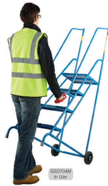
GSD704M In Use