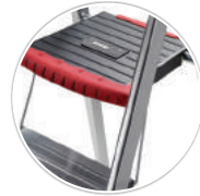
Unique double step & rubber platform strip for extra comfort