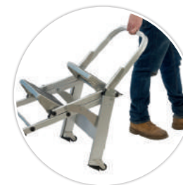
AFGS2Z - Tilt & Pull