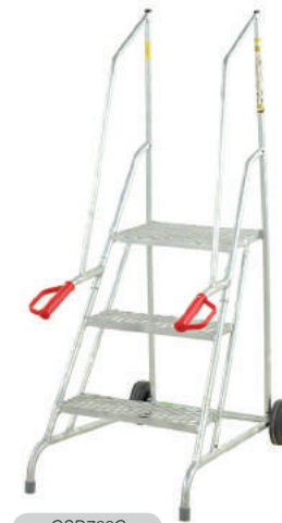
GSD703G Galvanised Finish