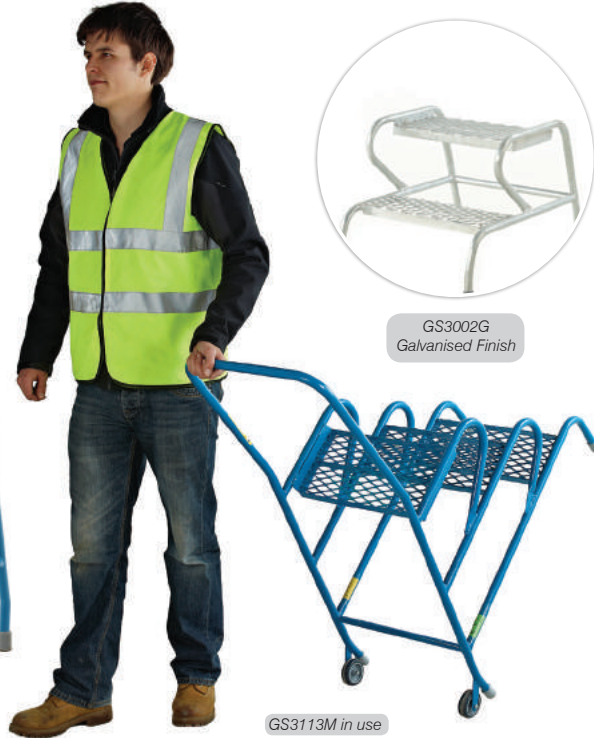
GS3113M in use