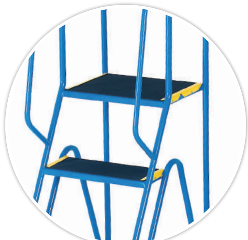
Resilient anti-slip treads with tread clamps