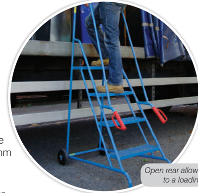
Open rear allows step through access to a loading bay or lorry etc