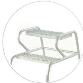
GS3002G Galvanised Finish