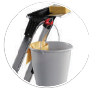
Tool tray & bucket hook